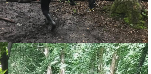
Lower 3 (Yr 6) visited Thriftwood for an amazing day full of activities.