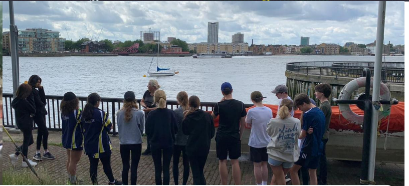
Lower 5 (Yr 10) PE GCSE course have spent the week rowing on the Thames. What a fantastic opportunity!