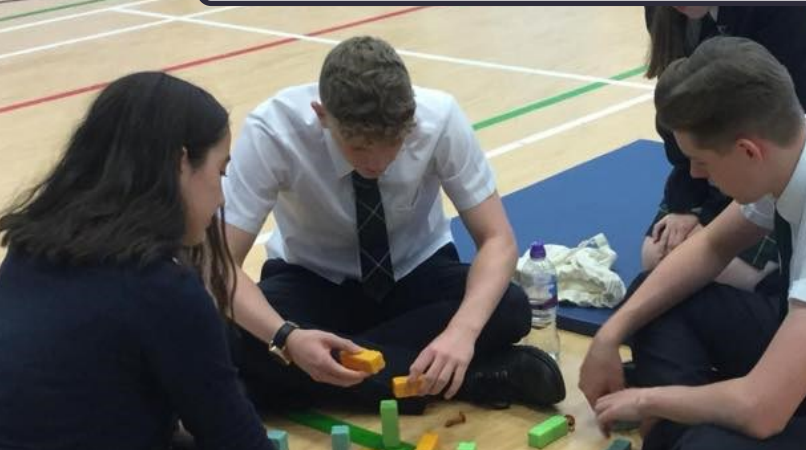
Upper 5 (Yr 11) Prom at Pontland's Park