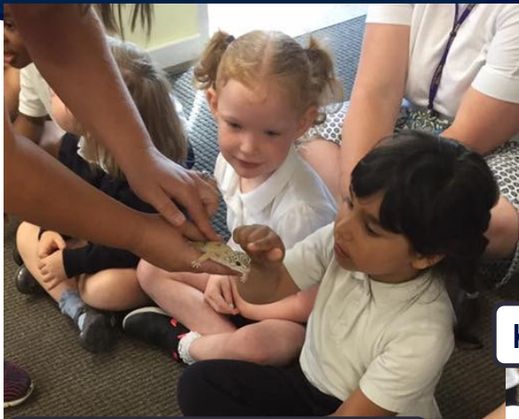
Zoo Lab visited Kindergarten