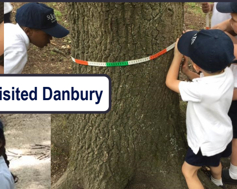
Reception & Lower Kindergarten visited Danbury