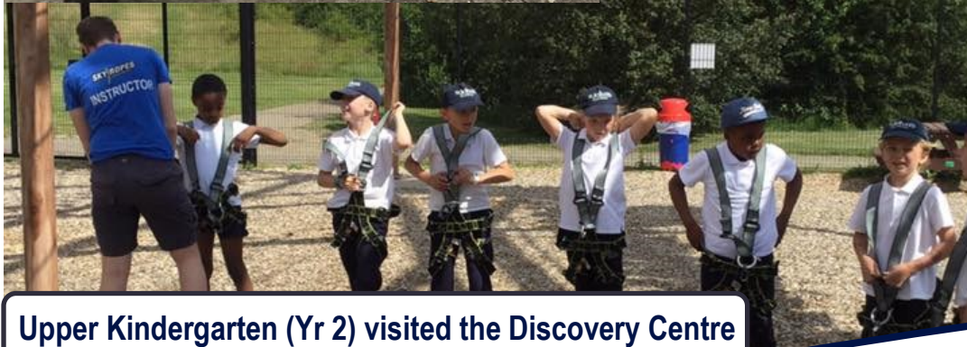
Upper Kindergarten (Yr 2) visited the Discovery Centre