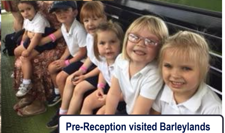
Pre-Reception visited Barleylands