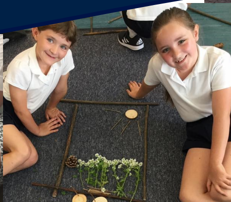
Kindergarten made natural collages