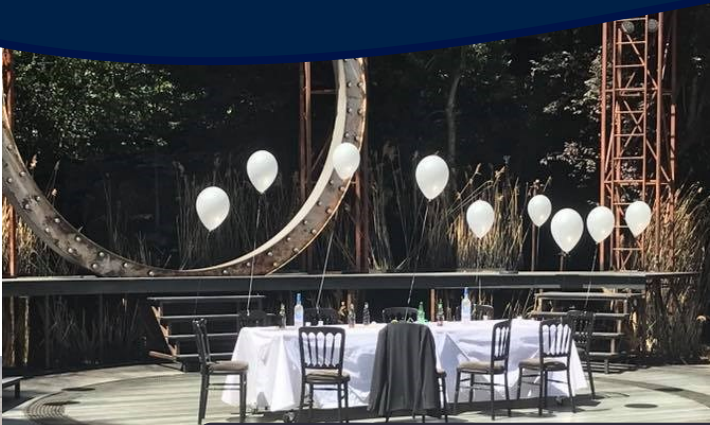
Upper 3 (Year 7) pupils visit Regent's Park to watch a Midsummer Night's Dream