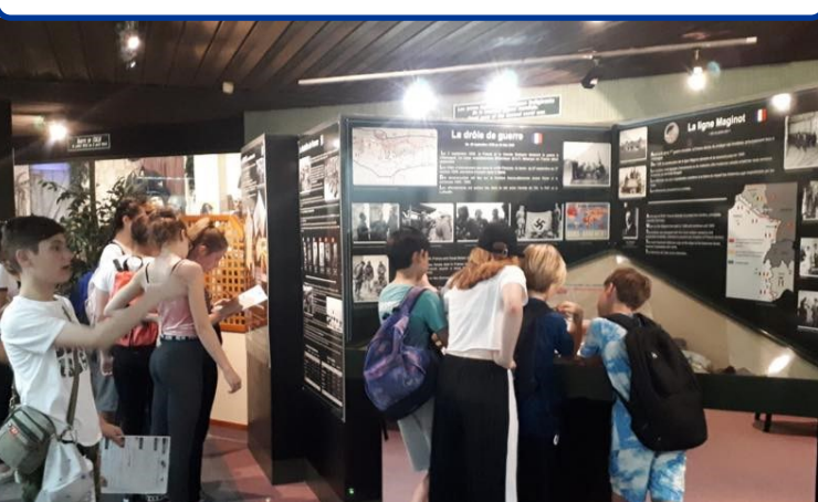
Upper 3 (Year 7) and Lower 4 (Year 8) residential to France