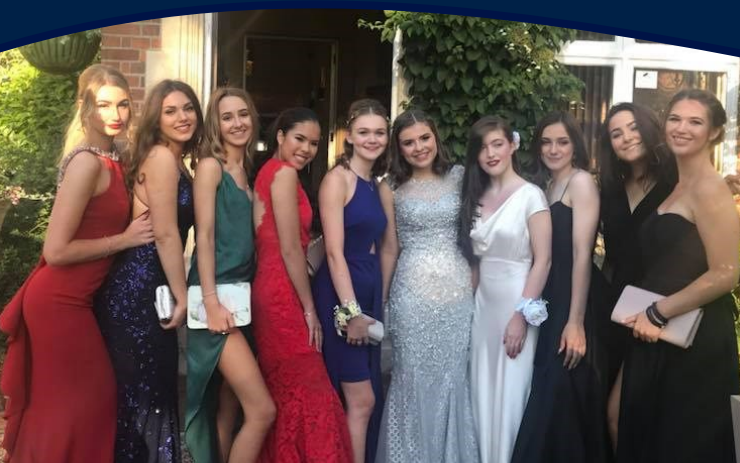
Upper 5 (Year 11) Prom at Pontlands Park