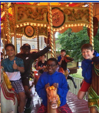
Lower 3 (Year 6) residential to York