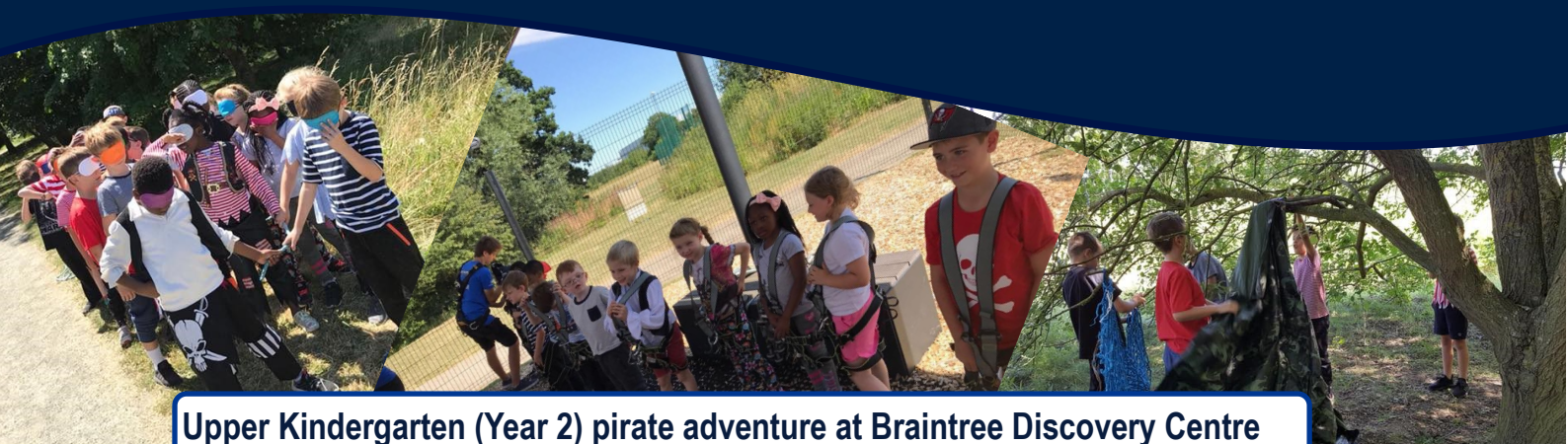
Upper Kindergarten (Year 2) pirate adventure at Braintree Discovery Centre