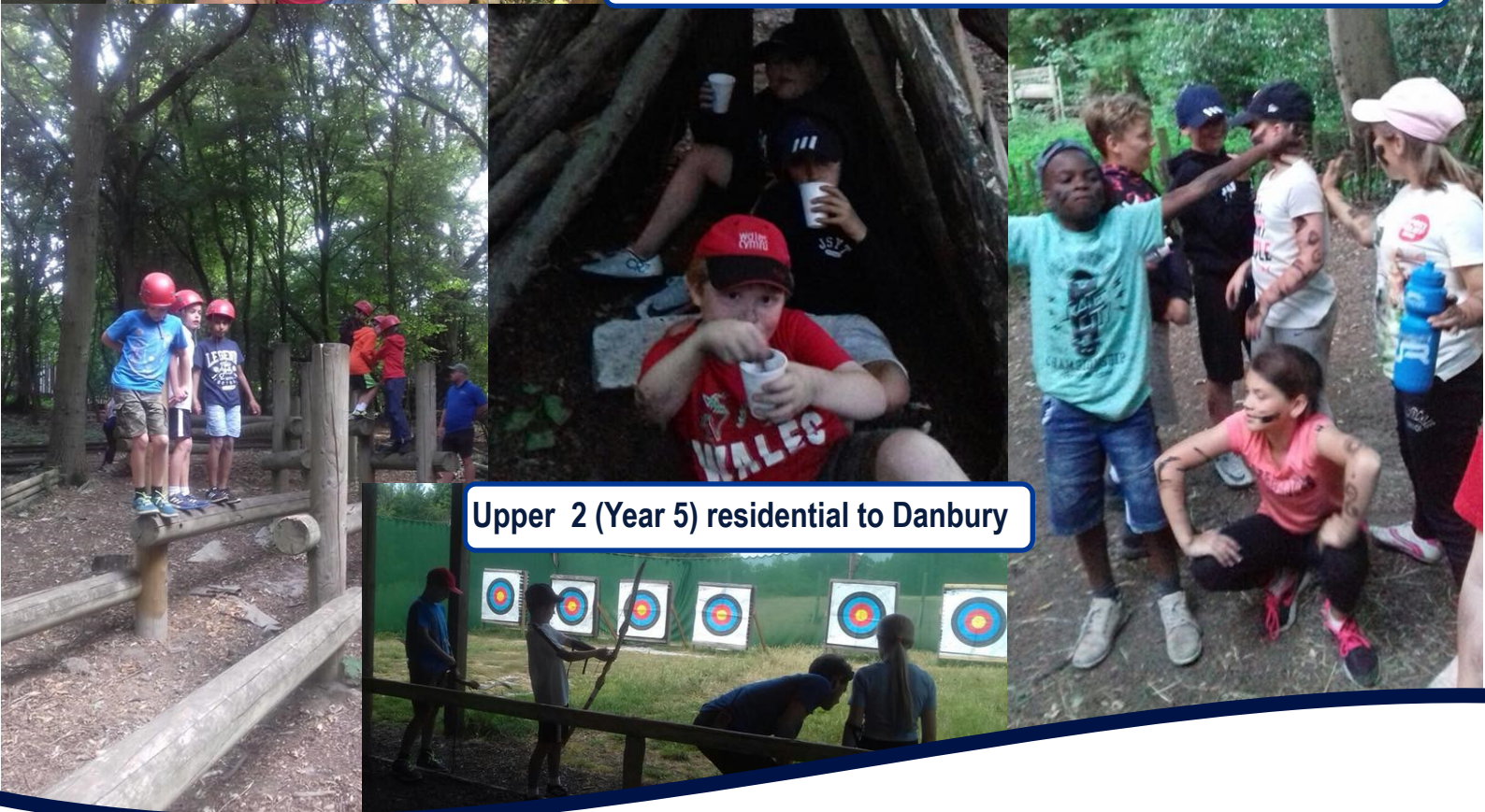
Upper 2 (Year 5) residential to Danbury

For further information and regular updates please visit our Facebook page